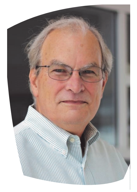
IUS is headquartered at Loyola University Chicago, but has Fellows in over 35 countries.

The seminar sponsors a biennial scholarly conference so its members can read and discuss current research in the field. It established and still publishes the journal, Armed Forces & Society , in 1973. The journal is now ranked eighth among military science journals according to the latest Google Scholar rankings.